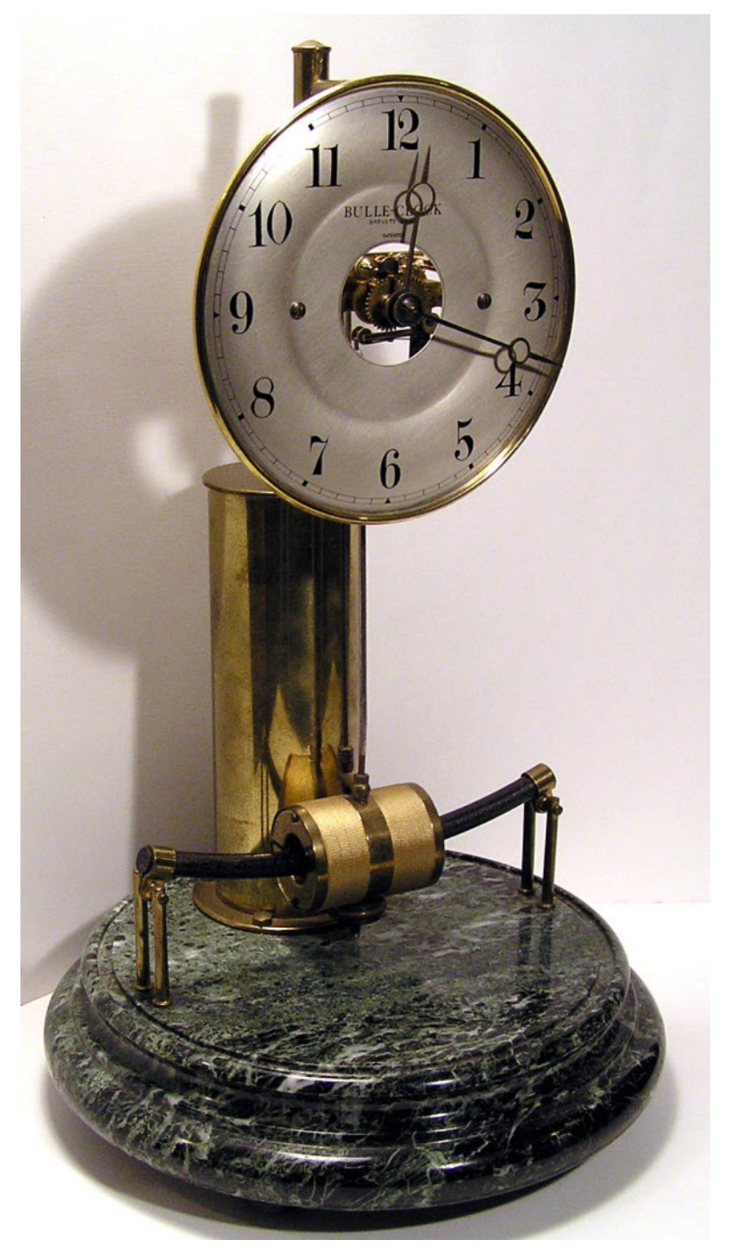
This file was originally part of the Gallery on the www.horologix.com website. It has been converted to pdf to facilitate downloading.

This is another absolutely fascinating Bulle clock. It has a green marble base with all the brass ware bolted right through instead of screwed or pushed in as an interference fit. The dial is formed alloy inserted into the normal pressed brass surround. But the surround itself has been completely silvered to match. The edges have worn down to the brass but the silvering can be seen on the back and where the outer curve is pressed back into the dial. But what is most interesting is the Isochron adjuster. I have only seen this on one other clock but that was in a wooden case with one end attached to a graduated dial in the wood. This one is a free standing attachment with no dial. The only problem seems to be the usual acid burns in the tube. Other than that this is going to turn out to be a beautiful and rare clock.